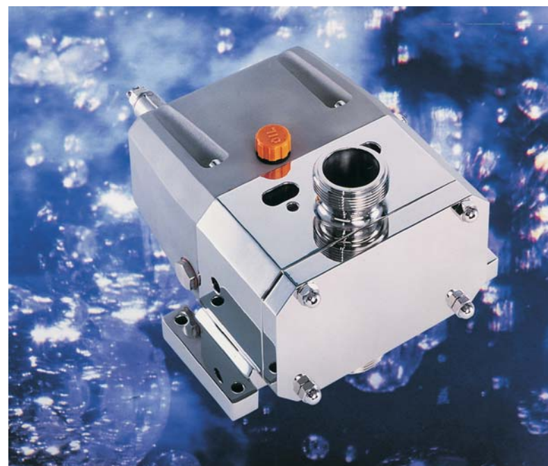
Concept SQ Pump with optional Stainless Steel Gear Cover

Inlet and outlet ports can be finished to a variety of clamp, thread or flange standards, with aseptic fittings available where barrier circulation is required to ensure that the process environment is reliably maintained.