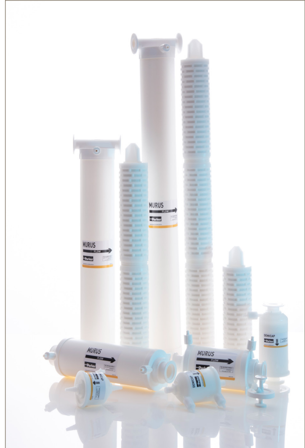
Note: PROCLEAR and DEMICAP are registered trademarks of Parker Hannifin Corporation.